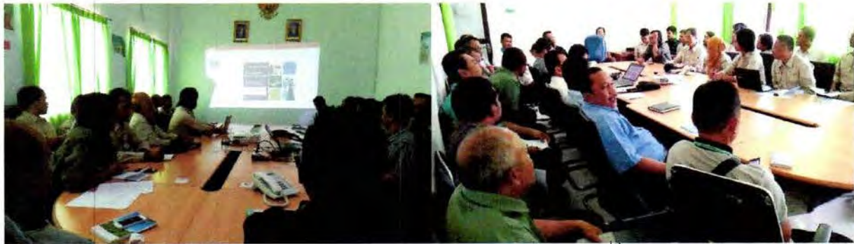
Opening meeting on HCV and HCS assessments in Sintang, 6 th September

HCS and HCV field assessments are being carried out by Aksenta at the sites of PT Sumber Hasil Prima (SHP) and PT Sinar Sawit Andalan (SSA) in Sintang. An opening meeting was held on 6 th September after which field assessments commenced. The field assessments are due to be completed by 19 th September.