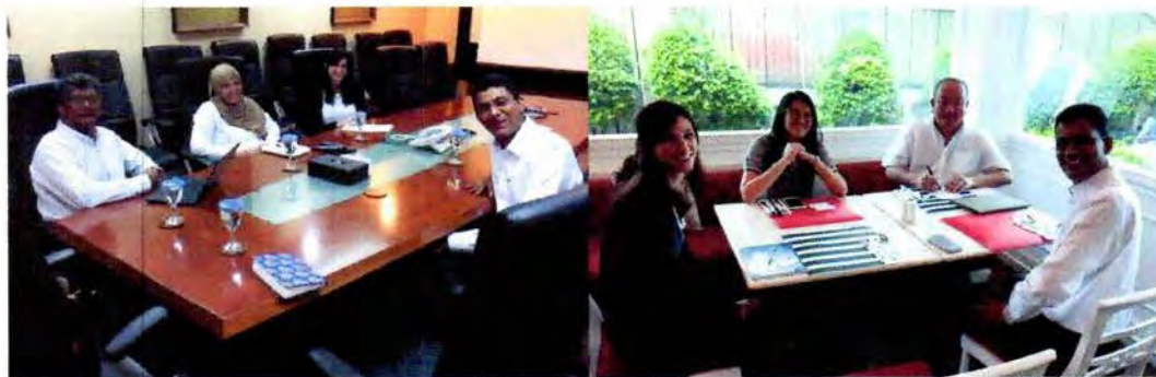
Meetings with Musim Mas (left) and KLK(right)

All parties expressed their recognition of the positive actions being taken by Goodhope in compliance with the decisions of the RSPO Complaints Panel.