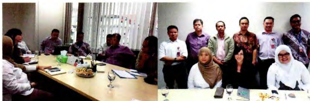
Meeting with GAR