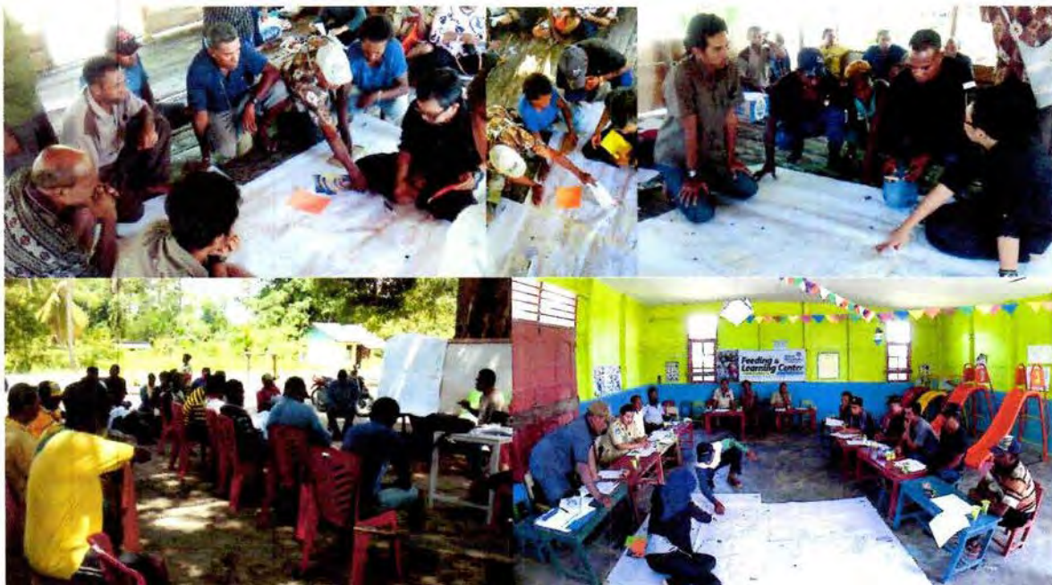
Focal group discussions and participatory mapping

Participatory mapping with representatives of the communities at the villages of Sima, Wanggar, Wami and Yaro Makmur allowed information to be gathered on land-use perspectives. At a number of focal group meetings, commencing from 22 nd August, communities expressed their wish for plasma obligations to be met and for plantings to go ahead, irrespective of conservation status. The one exception regards an area in the designated plasma area of Co-operative Akaba where there is a sizable Sago plantation and it is widely agreed that this area should be left for Sago palms.