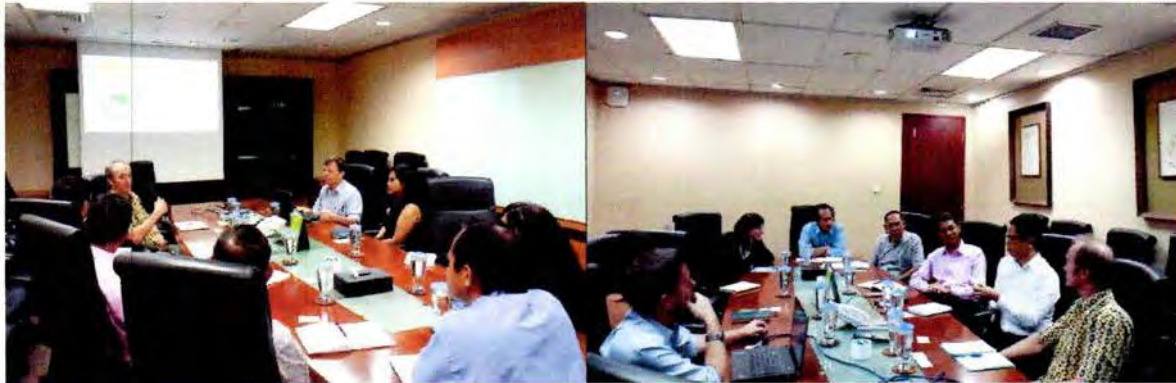
Presentation on the results of HCV, HCS and peatland assessments and discussions relating to the HCS Approach