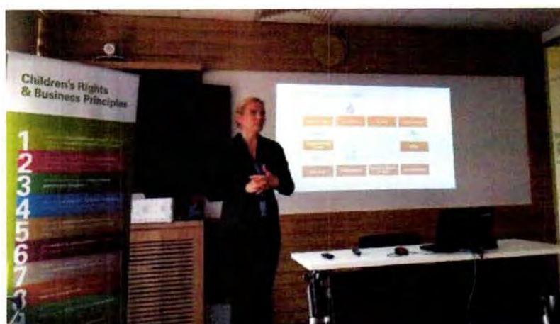
UNICEF Kick-Off Workshop on Children Rights and Business Principles (CRBP) studies.

A workshop for participating companies was held on August 31 st at the UNICEF premises in Jakarta to outline the key child rights considerations in the palm oil plantations, introduce the training topics and material that will be delivered in the plantations, clarify the objectives of the baseline study, and discuss plans for plantation visits.