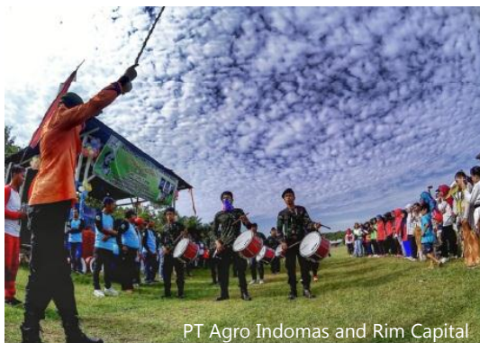
PT Agro Indomas and Rim Capital