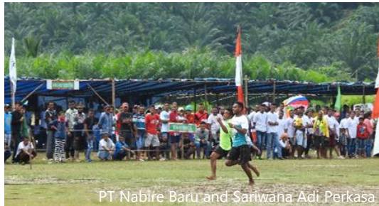
PT Nabire Baru and Sariwana Adi Perkasa