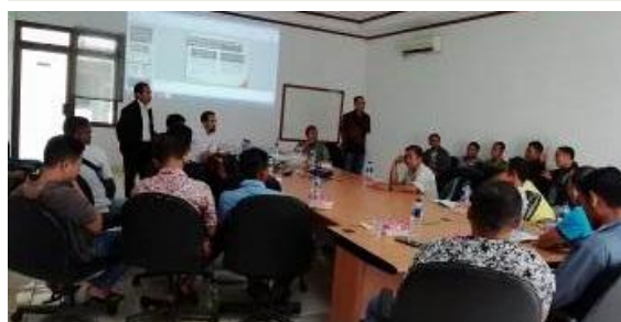
Tax Administration Training for Plasma Cooperative Management, PT Agro Bukit, Central Kalimantan, 15 th April 2019.