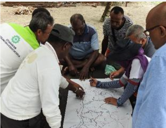
Participatory mapping for conservation management planning.