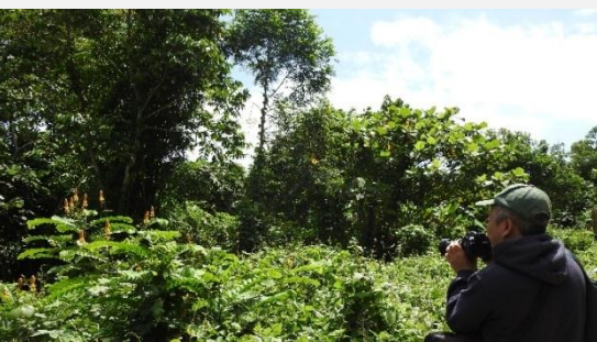
Survey of HCV areas.