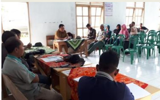
Traceability Socialization at Bukit Indah village, Central Kalimantan, May 2019.