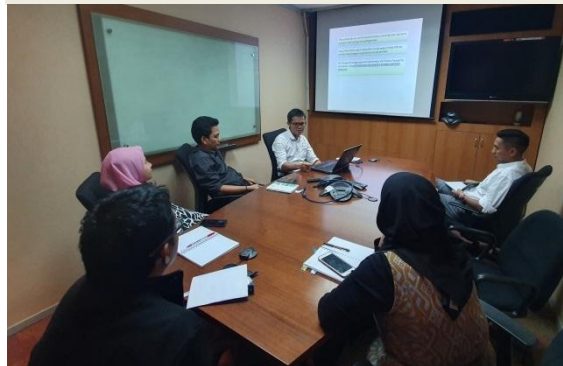
Traceability - Training for logistic, sale operation, Sustainability, Government relation and compliance, 13 th May 2019.