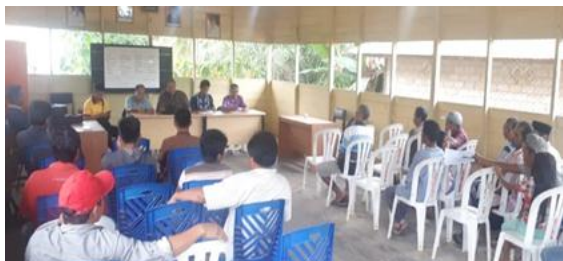
Traceability Socialization at Batu Agung village, Central Kalimantan, May 2019.