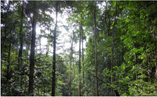
HCV/HCS forest within the PT NB and SAP concessions.