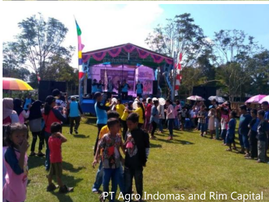
PT Agro Indomas and Rim Capital