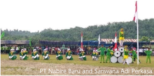
PT Nabire Baru and Sariwana Adi Perkasa