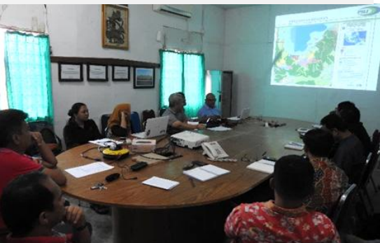
Conservation Management Planning Meeting at PT Nabire Baru.