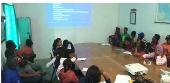
First Aid Training for employees at PT Nabire Baru and PT Sariwana Adi Perkasa. Organized by EHS Department in cooperation with medical team, 22 nd February 2019.