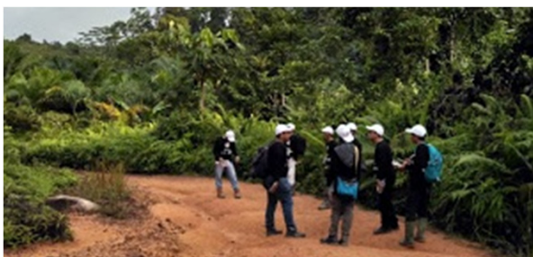
Practical training on conducting surveys to monitor gibbons.