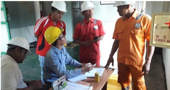
Sustainability internal audit at Sungai Binti Mill. 28 th February 2019.