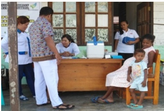
Free medical services for the people of Sima Village, Yaur District, Papua (2 nd January 2019) facilitated by cooperation between PT Nabire Baru and Wami Jaya Community Health Center (PUSKESMAS).