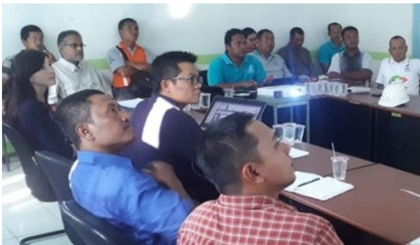
Sustainability Management Review. PT Agro Wana Lestari and PT Karya Makmur Sejahtera. 18 th March 2019.