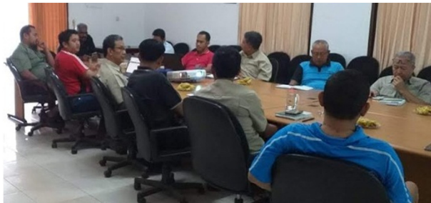
Sustainability Management Review. PT Agro Bukit. 16 th March 2019.