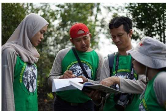
Practical training on the identification and monitoring of wildlife species, 27 th March 2019.