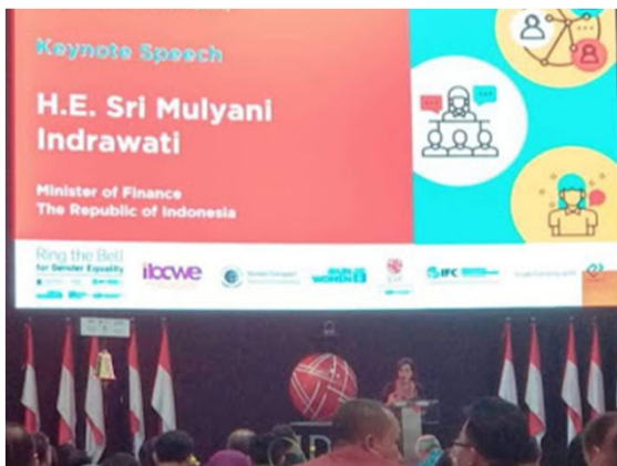
"Ring the Bell for Gender Equality" 13 th March 2019. Indonesia Stock Exchange.