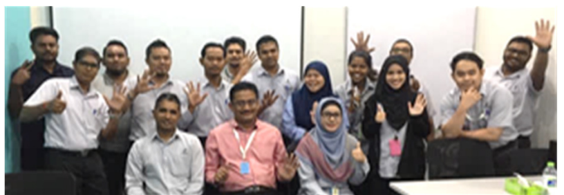
5S Training and weekly 5S activities introduced to employees at the Premium Group in August 2018 as part of our program to build the 5S culture among employees.

Goodhope is increasingly promoting the 5S workplace organization method (translated as "Sort", "Set In order", "Shine", "Standardize" and "Sustain") to enhance efficiency and effectiveness through maintaining a clean, tidy and healthy environment for working place. We also extend the practice to encourage healthy living environments for workers living on-site at plantations.