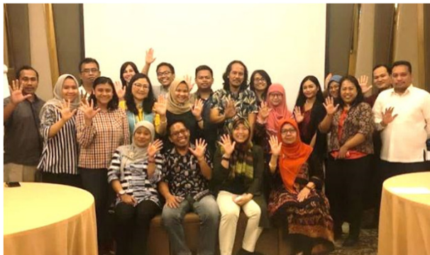
IGCN Business and Children's Rights Working Group. Learning Session 1: "How businesses adopt Children's Rights and Business Principles", 25 th February 2019.

Participation in the IGCN Business and Children's Rights Working Group Learning Sessions follows in from our involvement in the collaborative Children's Rights and Business Principles Palm Oil Program to promote Children's Rights in the palm oil industry and the development action plans and best management practices to address issues affecting children in the palm oil sector.