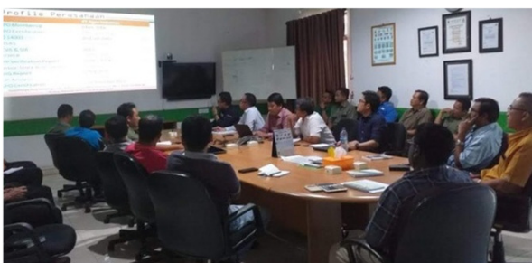
ISO 14001 Re-certification Assessment Visit and OHSAS 18001 Continual Assessment Visit (CAV) at PT. Agro Indomas, Central Kalimantan.