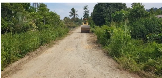
Road improvement activities on the road to Wami Jaya village (Nabire region, Papua) were completed in February 2019 through cooperation between the company (PT Nabire Baru) and village officials.