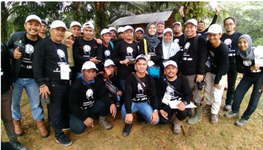
Conservation Training on Bornean Gibbons and their Habitat, PT Agro Wana Lestari - PT Karya Makmur Sejahtera (26 th -28 th February 2019).