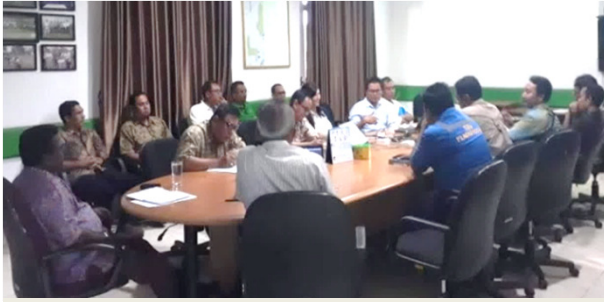
Sustainability Management Review. PT Agro Indomas, Central Kalimantan and PT Rim Capital. 22 nd March 2019.