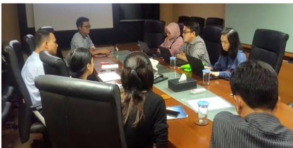
Third party sustainability assessment of our upstream operations conducted by Environmental Resources Management (ERM).