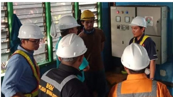
Verification by external auditor, Bukit Santau Mill, 19 th March 2019.