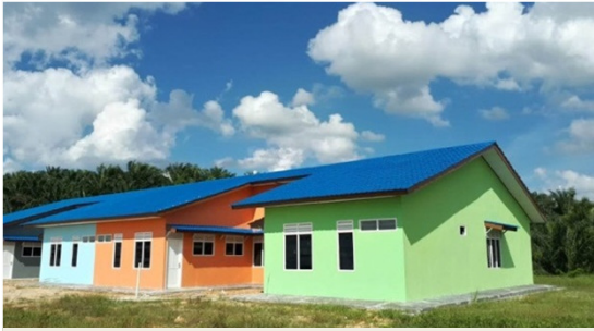
New housing provided for workers and their families at PT Agro Wana Lestari, March 2019.