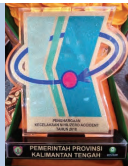
Zero Accident Award received from the Governor of Central Kalimantan province.