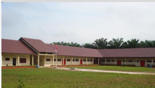
Our Junior High School SMP Tunas Agro at PT AICK.

Skills and knowledge attained will be applied to promote the implementation of adopt enhanced education systems and practices by our schools, promoting the integration of sustainability and environmental protection.