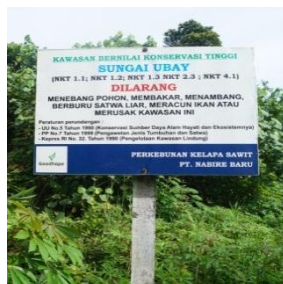
HCV riparian zone sign at PT NB.