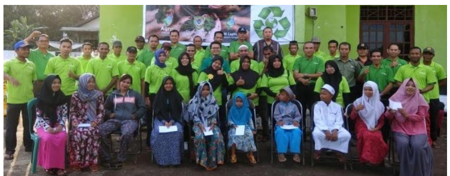
Celebrating World Environment Day PT Agro Indomas Central Kalimantan.