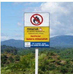
Fire prohibition sign at PT NB