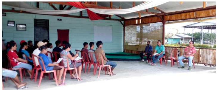
Environmental Health and Safety briefing new workers at PT Nabire Baru and PT Sariwarna Adi Perkasa (25 th May 2018).