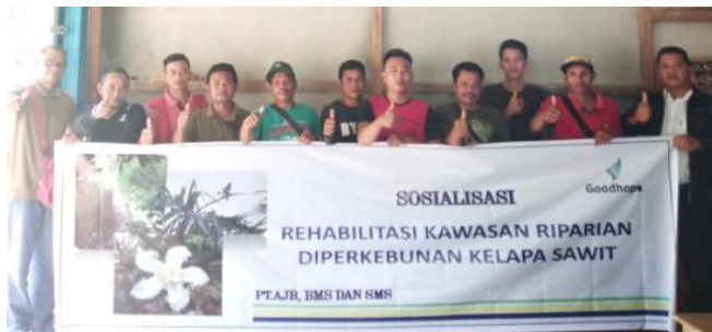
HCV socialization for community representatives from villages nearby Goodhope's concessions in Ketapang district, West Kalimantan: The rehabilitation of riparian reserves (6 th June 2018).