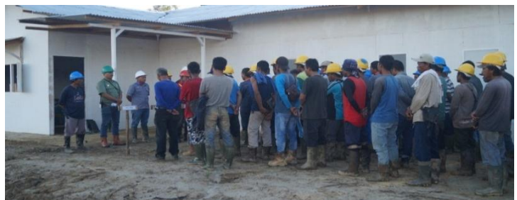
Environmental Health and Safety briefing to contractors prior to their work on development activities for the construction of PT Nabire Baru Mini Mill (14 th May 2018).