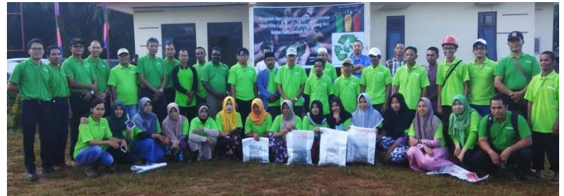
Participants in World Environment Day waste management activities at PT AICK.

The focus was on promoting action for environmental protection.