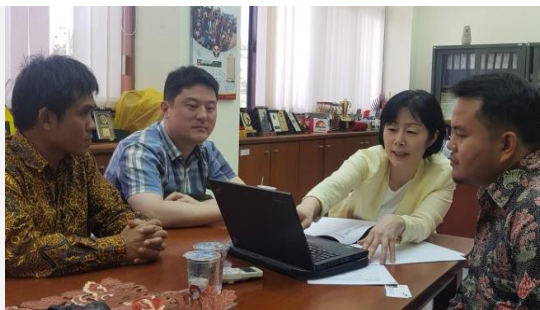
Discussions during the workshop on Convergence Education (4 th -5 th May 2018).

Workshops and Training Programs provide exceptional opportunities to encourage improved performance of our education program.