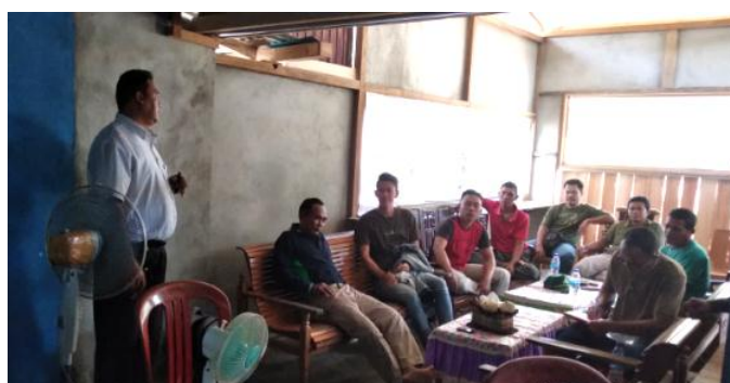
Presentation and Focus Group Discussion on HCV management for community representatives.

The event also provided important feedback to evaluate the implementation of conservation management and monitoring activities, including the review of Standard Operating Procedures.