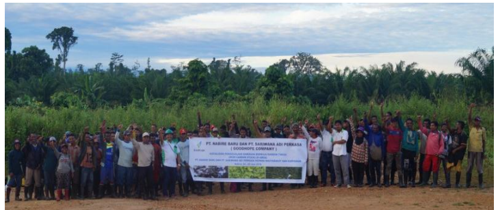
High Carbon Stock Socialization to employees at Bukit Nuhgojaje Estate and Kali Bambu Estate, PT Nabire Baru and PT Sariwarna Adi Perkasa (4 th - 5 th June 2018).