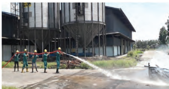
Fire Drill and Emergency Response Procedures, PT Agro Bukit Central Kalimantan, 28 th January 2019.