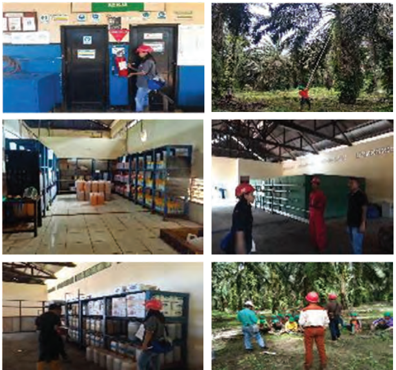
Environmental Health and Safety Field Inspections to monitor the working practices adopted by plantation workers and to assess various sites including medical clinics, security posts, offices, mills, workshops and storage facilities at PT Rim Capital and PT Agro Indomas, Central Kalimantan, 14 th -28 th January 2019.