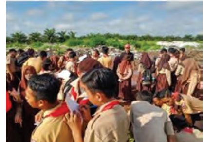
Students from SMP Tunas Agro visited landfill site and Waste Bank Project in Terawan Estate, PT Agro Indomas, Central Kalimantan.

The overall goal of our education program is to provide good quality education that will contribute to empowering our students. Demonstrating positive impacts, our internal school, SD Tunas Agro achieved General Winner of the Seruyan subdistrict Science Olympics 2019. This event is held annually by school committee in Seruyan with 11 elementary schools in the subdistrict participating. Three of our students achieved top positions in various categories, one winning first prize. The winner is eligible to compete in the next round of the competition (regional level).