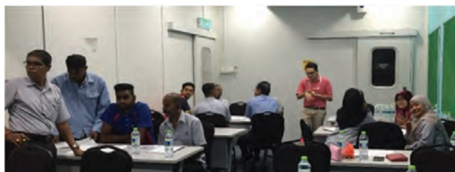
Food Allergen Handling Training, Premium Vegetable Oils Sdn Bhd, Pasir Gudang, Johor Bahru; 27 th November 2018.