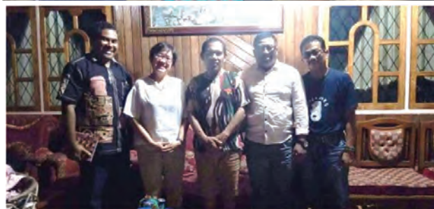
Scoping visit to Nabire on Landscape Management by IDH team on 16 th -18 th January 2019.