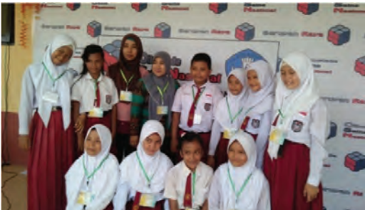
SD Tunas Agro's students take part in and win the title as General Winner of the Seruyan Science Olympics 2019