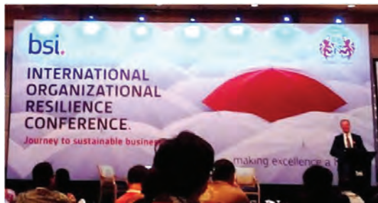
British Standards Institute International Conference on Organizational Resilience, Jakarta, 12 th February 2019. Representative from PT Agro Harapan gained insight into the ISO standards and the role of BSI.