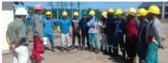
Fire Drill and Emergency Response Procedures, PT Agro Wana Lestari, 10 th January 2019.