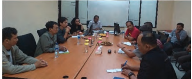
Traceability scoping visit, 14 th -18 th January 2019. Bumi Jaya Mill, East Kalimantan.

Another scoping visit has now been completed at our sites in Central Kalimantan (four mill locations): Bukit Santuai Mill, Sungai Purun Mill, Terawan Mill and Sungai Binti Mill. The scoping visit began on 19 th February 2019 at Bukit Santuai Mill, PT Agro Wana Lestari.