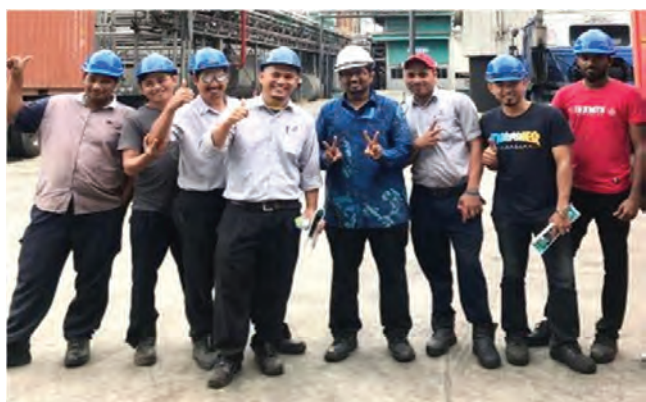
Food Handlers Training by First Wing Training Agency, Premium Vegetable Oils Sdn Bhd, Pasir Gudang, Johor Bahru; 28 th January 2019.