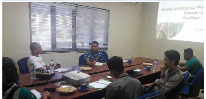
Opening meeting of the scoping visit at Bukit Santuai Mill on 19 th February 2019.