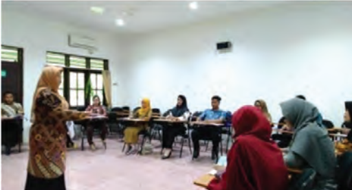
Teacher Training held on 22nd-24th January 2019 at the Goodhope's Training Center, PT Agro Indomas, Central Kalimantan.