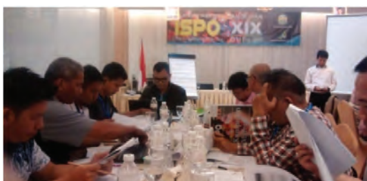
Indonesian Sustainable Palm Oil (ISPO) Certification System Auditor Training Course, 11 th -16 th February 2019.