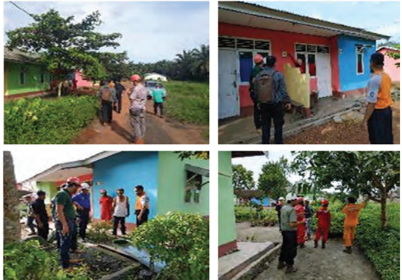
Emplacement Inspections at Terawan Estate, PT Agro Indomas, Central Kalimantan, 25 th -29 th January 2019.

Our internal assessments include document reviews to ensure the availability and use of operational procedures and to promote the need to make updates as required in alignment with policies and standards.