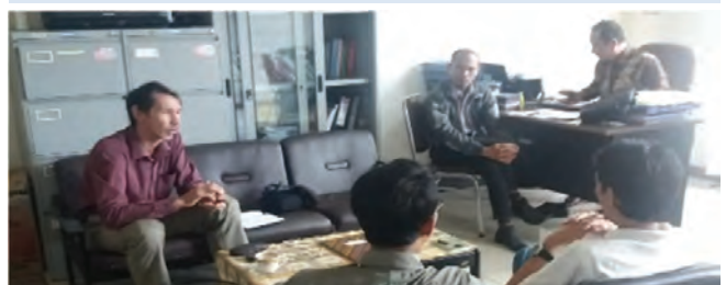
Meeting with the local Government authority (Dinas Perkebunan) Penajam Paser Utara regency, 17 th January 2019.