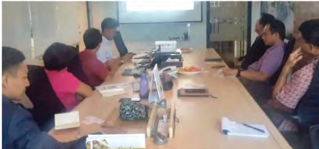
Discussions between Goodhope (PT Agro Harapan Lestari) and IDH team regarding proposal for Nabire Landscape Management.