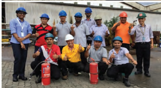
Fire Safety Training at Premium Vegetable Oils Sdn Bhd, Pasir Gudang, Johor Bahru; 31 st December 2018.