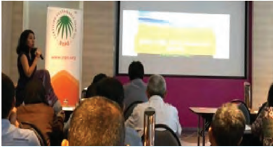
RSPO Roadshow, Jakarta, 11 th -12 th February 2019. Participants from PT Agro Harapan Lestari had the opportunity to learn more about the new RSPO Principles and Criteria 2018 and the RSPO audit checklist which will be launched in June 2019.