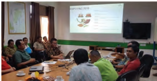
Internal training on new RSPO Principles and Criteria, PT Agro Indomas, Central Kalimantan, February 2019.