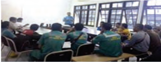
Safe Driving Training at PT Agro Bukit Central Kalimantan, January 31 st 2019.