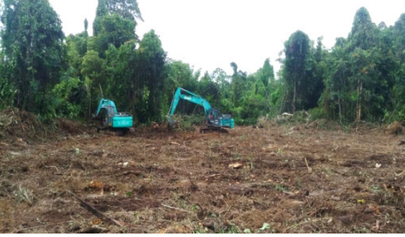
Customary ritual ceremony and land preparation at the site of the proposed mill (PT Nabire Baru, 24<sup>th</sup> January 2018).