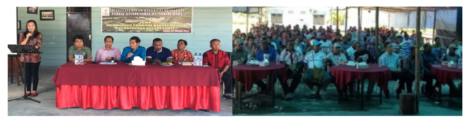
Public consultation to inform stakeholders on issues regarding mill construction PT Nabire Baru, 26<sup>th</sup> January 2018).

Mill construction will proceed in compliance with the Yerisiam Community terms of agreement (page 6) and is expected to be completed in October 2018.