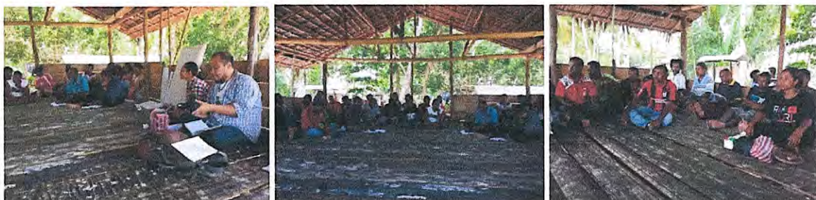
Meeting on mediation procedures with the local community of Yerisiam Gua in Kampung Sima.

The process of dispute settlement was discussed further on July 19th 2017 at a community meeting facilitated by Yayasan Pusaka and the RSPO-endorsed Conflict Resolution Unit (CRU) of ICSBD. Procedures for mediating the settlement of grievances under the RSPO Dispute Settlement Facility (DSF) were discussed.