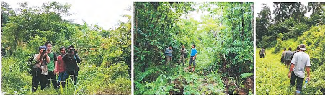
HCV field assessment in PT MBS and PT SMS.

HCV assessments were conducted at the sites of PT Batu Mas Sejahtera (BMS) and PT Sawit Makmur Sejahtera (SMS) over the period July 10th-20th 2017. The assessments were carried by a team from Aksenta subsequent to HCV assessment of PT Agrajaya Baktitama (AJB) that took place from June 11th-22th 2017.