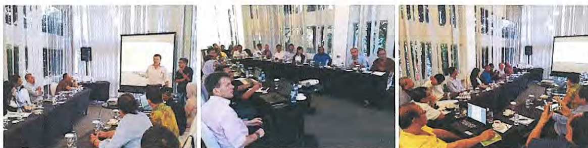
Public consultation on various assessments and compliance review of PT Nabire Baru and PT Sariwana Adi Prakasa.