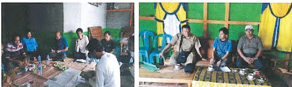
Series of meetings with key stakeholders in Sintang.