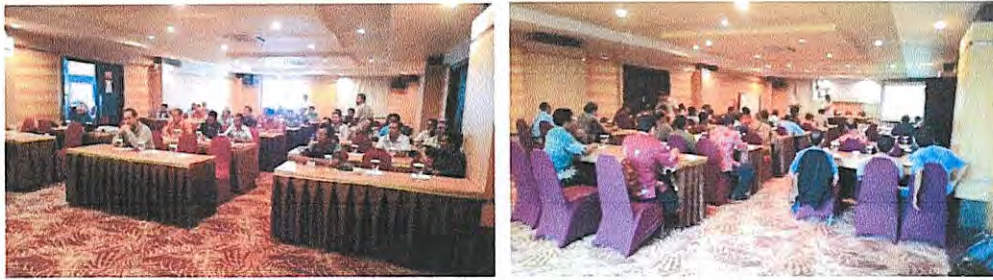
Public consultations on the HCV assessments of PT AJB, PT MBS and PT SMS in Ketapang (left) and Pontianak (right).

While LUCA report is prepared for individual company, the HCV Assessment for Ketapang will be reported in an integrated report to include the three companies, i.e., PT AJB, PT BMS and PT SMS.