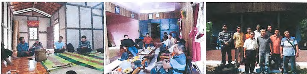
Focus Group Discussions with villagers at PT BMS and PT SMS.

Focus Group Discussions were held in villages near to PT BMS and SMS area in order to identify areas of high cultural / social value. Customary elders from 18 villages were invited to discuss HCV 5 and 6 locations.