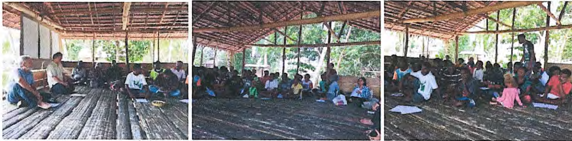
Community workshop on dispute settlement facilitated by CRU in Kampung Sima, Nabire.