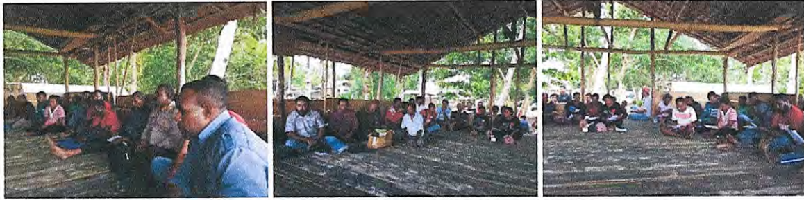
Discussion on mill construction at PT Nabire Baru during a Yerisiam community meeting in the Sima Village.

During the meeting, representatives of the Yerisiam Gua community expressed their support for the development of a mill under specific terms that were later defined and agreed upon by the community. At a later meeting held on July 30th 2017, members of the community affirmed their understanding and agreement of the terms by signing a Statement of Support for the construction of a mill. The terms of agreement are as follows: