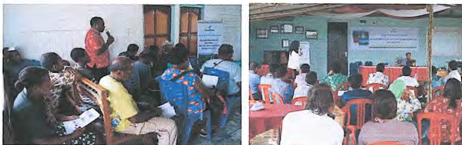
Familiarization of NDPE to local communities (left) and contractors/suppliers (right) in Nabire.

On the same day, Goodhope also engaged with local communities to present NDPE policies. The presentation in Desa Sima, Nabire was attended by 40 people including people from Cooperatives and Yeresiam Gua community. Communities showed their support to the implementation of the policies.