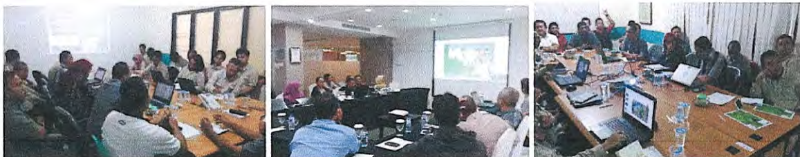
Induction meeting on scoping study on LUCA, HCS and HCV assessment in PT SHP and PT SSA, Sintang.

A team from Aksenta conducted LUCA and scoping studies of High Carbon Stock (HCS) assessments and HCV assessments at Sintang, West Kalimantan (PT Sumbar Harapan Prima (SHP) and Sinar Sawit Andalan (SSA) from August 5th-16th 2017. The team held a opening meeting on August 5th 2017 in Serawai, Sintang, at which the agenda and workplan for the studies were agreed.