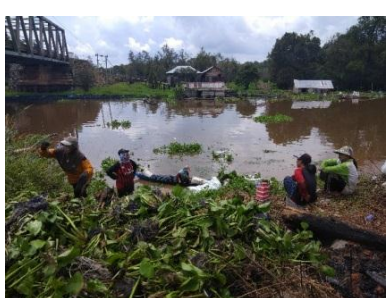
River condition after cleaning