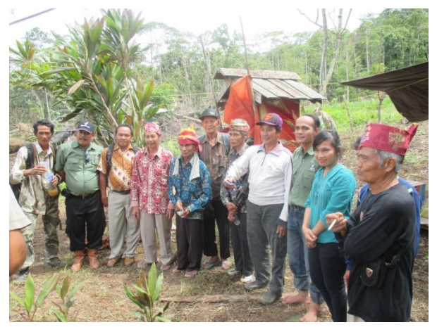
Traditional ceremony on launching of the Bukit Santuai designation as customary forest in February 2015

The second part of the scoping visit for the development of an enhanced conservation and community development program at Bukit Santuai involved visits to some of the villages located around this area, including Tumbang Penyahuan, Tanah Haluan and Keminting.