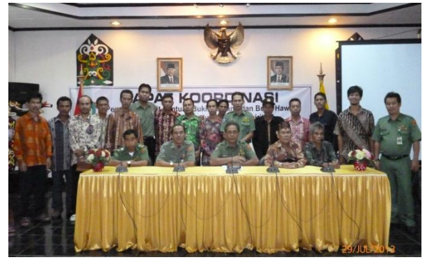
Multistakeholders meeting with local government on designation of Bukit Santuai as customary forest, July 2013