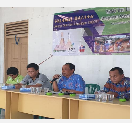
FFS speech delivered by Head of Bukit Indah village. during farmers' training on 20<sup>th</sup> January 2020