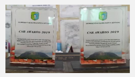
CSR Awards from Sintang Head of Regent, awarded to PT Sumber Hasil Prima and PT Sinar Sawit Andalan. 16<sup>th</sup> December 2019.