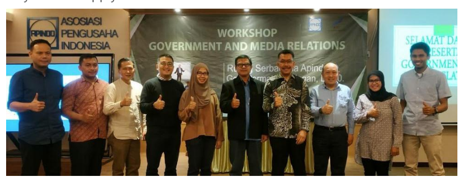
APINDO Workshop on Government and Media Relations. 27th-28th February 2020.

The meeting provided valuable information and exchanges on how to handle media and government relations as a means to build stakeholder relations and achieve favourable social environment for our business activities.