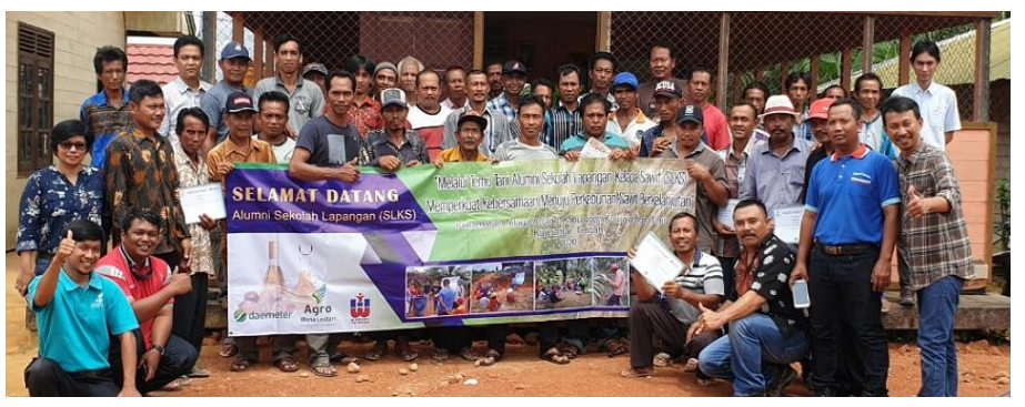
FFS Participants at Batu Agung village. 28th January 2020

Capacity building program under FFS will be continued for FFS participants and expanded to reach more smallholders who have not yet had the opportunity to join the training program.