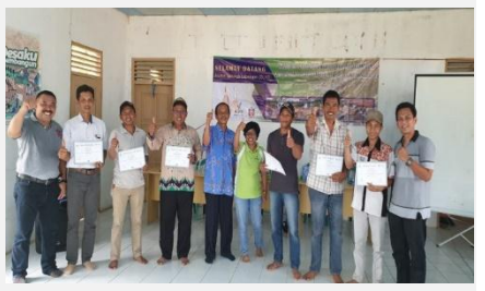
FFS participants at Bukit Indah Village, 30<sup>th</sup> January 2020.