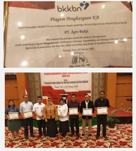
PT Agro Bukit was awarded for its contributions to Family Planning and Health programs. 25<sup>th</sup> - 26<sup>th</sup> February 2020.

PT AICK Tunas Agro Primary School 1 (SD Tunas Agro 1) participated at the Seruyan Raya Sub District Science Olympiad Competition.