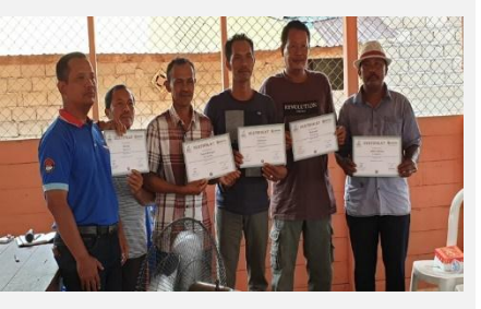
FFS participants at Batu Agung village, 28<sup>th</sup> January 2020.