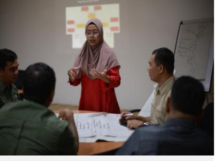
Training on Participatory Conservation Planning (PCP) and Social Impact Management, Goodhope Training Center in collaboration with Earthworm's CSE internship program. 24<sup>th</sup>-25<sup>th</sup> February 2020.