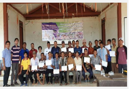
FFS Participants at Tribuana Village. 29<sup>th</sup> January 2020.