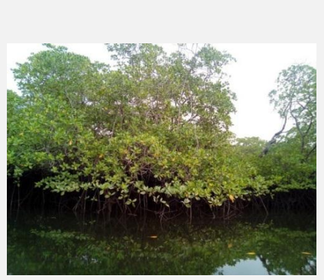
Mangrove forest, Balikpapan Bay holds high carbon stock / high levels of biodiversity` and that provides habitats for Rare Threatened or Endangered species.