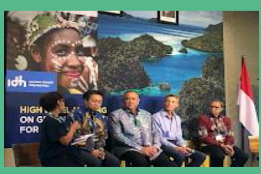
Multi-stakeholder Meeting on Green Development in Papua and West Papua facilitated by IDH. 27<sup>th</sup> February 2020.

Further to our involvement in the Ketapang District PPI Compact, we are looking to support application of the approach to optimize community based conservation and economic development in Papua.