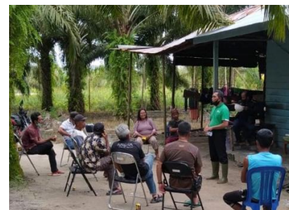
Farmer Field School for Independent Smallholders.