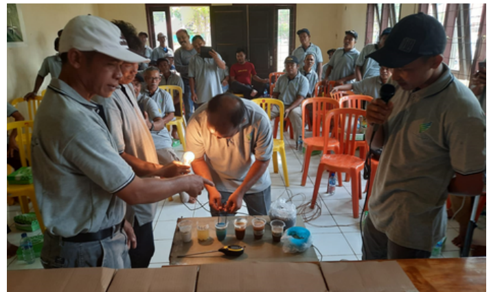
Lanpasa farmers getting hands-on experience during their session.

The value created by supporting the development of their entrepreneurial and managerial competencies is the glue that will strengthen our relationship with the smallholders.