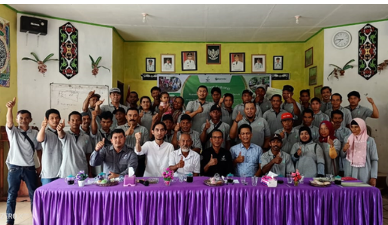
Smallholders from Bapeang at the close of the program

Through Farmer Field School, the smallholders learn about the morphology and physiology of oil palm, composting processes, optimization of fertilizers as well as steps on managing pests, diseases, and overall soil health